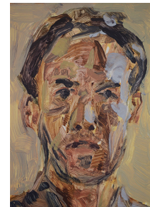
Self-Portrait, acrylic, 6" x 4", 2016