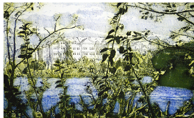
Riparian, etching/drypoint, 6" x 10", 2016