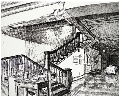
Washington Studio School Gallery, etching, 8"x10", 2016