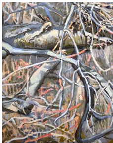
Winter Branches, acrylic, 30" x 24", 2017